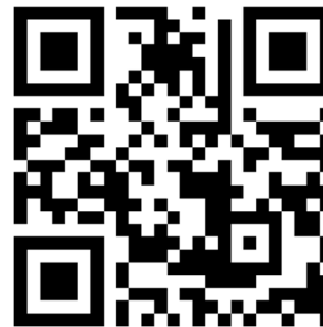
Dietary Needs Form